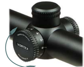
Adjust the side focus knob

Parallax is a phenomenon that results when the target image does not quite fall on the same optical plane as the reticle within the scope. When the shooter's eye is not precisely centered in the eyepiece, there can be apparent movement of the target in relation to the reticle, which can cause a small shift in the point of aim. Parallax error is most problematic for precision shooters using high magnification.