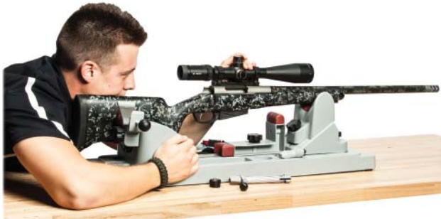
Visually bore-sighting a rifle.