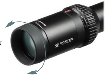
Adjust the reticle focus

Once this adjustment is complete, it will not be necessary to re-focus every time you use the riflescope. However, because your eyesight may change over time, you should re-check this adjustment periodically.