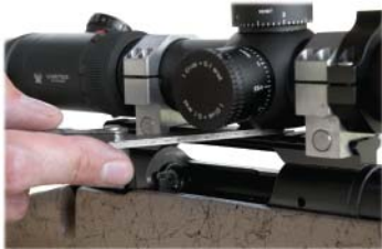
Use of an adjustable set of feeler gauges between a one-piece base and flat bottom section of the riflescope to square the riflescope (and reticle) to the base.