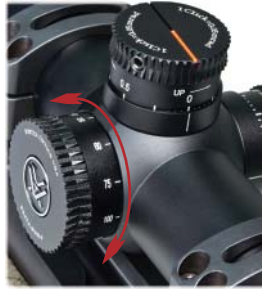
Adjust the side parallax knob

Parallax is a phenomenon that results when the target image does not quite fall on the same optical plane as the reticle within the scope. When the shooter's eye is not precisely centered in the eyepiece, there can be apparent movement of the target in relation to the reticle, which can cause a small shift in the point of aim. Parallax error is most problematic for precision shooters using high magnification.