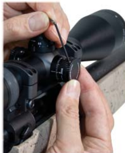
Align the windage turret cap.

Once the windage and elevation knobs are correctly indexed to the zero mark, temporary corrections can be safely dialed into the scope without worry of losing the original zero.