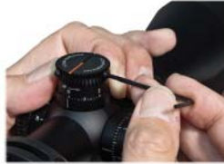
Align the elevation turret cap.